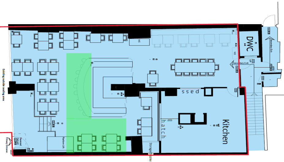
01 Proposed Floor Plan